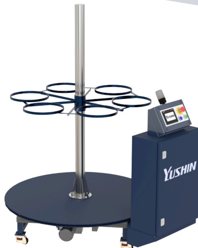
ROTARY BAG FILLER