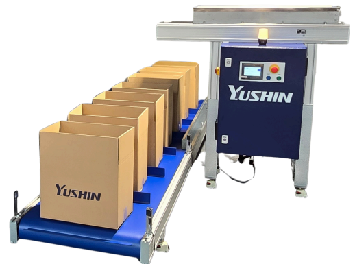
LINEAR BOX FILLER