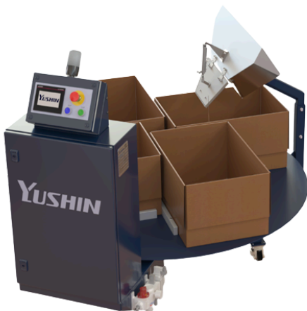
ROTARY BOX FILLER

Yushin has developed a range of simple systems to add to the end of your existing lines. With minimal set up time, these standard, out of the box solutions provide an easy answer to reduce labour overheads on repetitive box & bag filling applications.